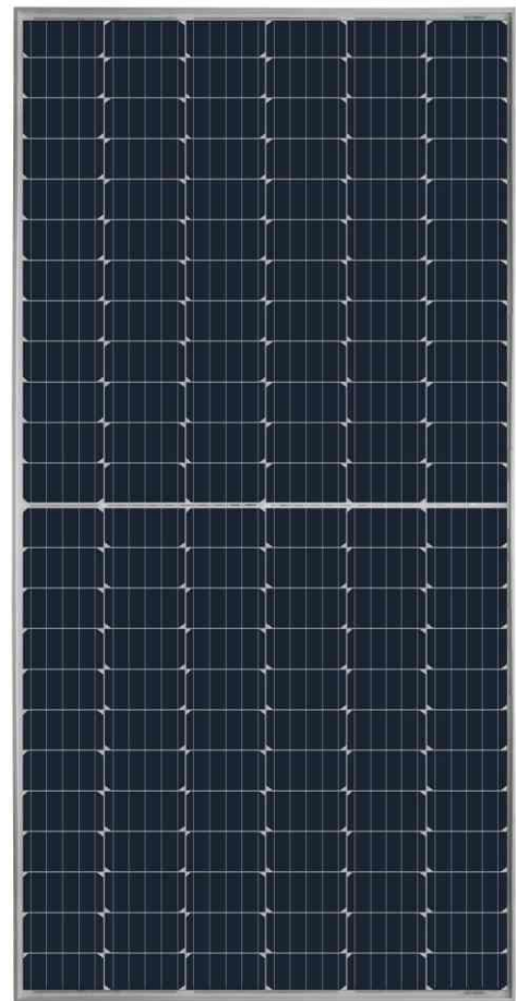
PV Module 25 Years Linear Performance Warranty